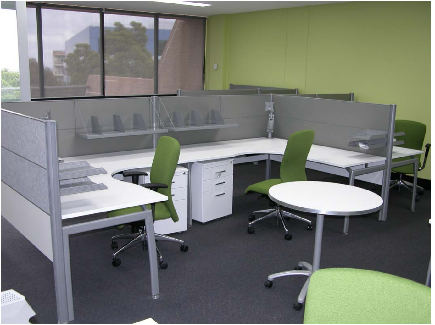
Classic Concept - Contemporary Capability